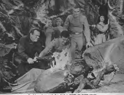
Fiendish creatures meets fiery finish in QUEEN OF OUTER SPACE.