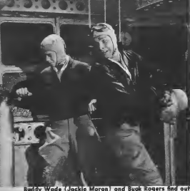
Buddy Wade (Jockic Moron) and Buok Rogers find out that their dirigible is about to crosh on an icy Arctic mountain.

There is no escape for Wilma Decring from these weird