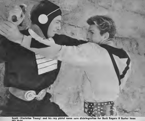
Scatt (Carleton Toung) and his ray pistol mean sure disintegration for Buck Ragers If Buster lases this fight.

partment store alone, 1500 were set loose upon the world, the first day on sale. The weapon was made of heavy metal in a super-futuristic design. When the trigger was pulled a snapping sound described as "Zap" was heard.