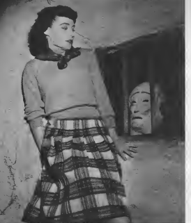
THE MAN FROM PLANET X puts the hex an Earth Girl. One of 3 Spacemen who heads far Mars in West Ger-