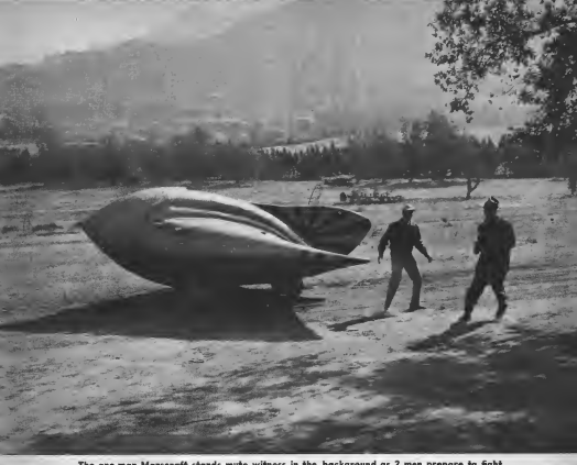
The ane-man Marscraft stands mute witness in the background as 2 men prepare to fight.