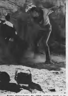
Buster demonstrates the "25th century slom" downs one of Killer Kone's men.

Dr. Huer and his assistants prepare their roy machine for immediate action.