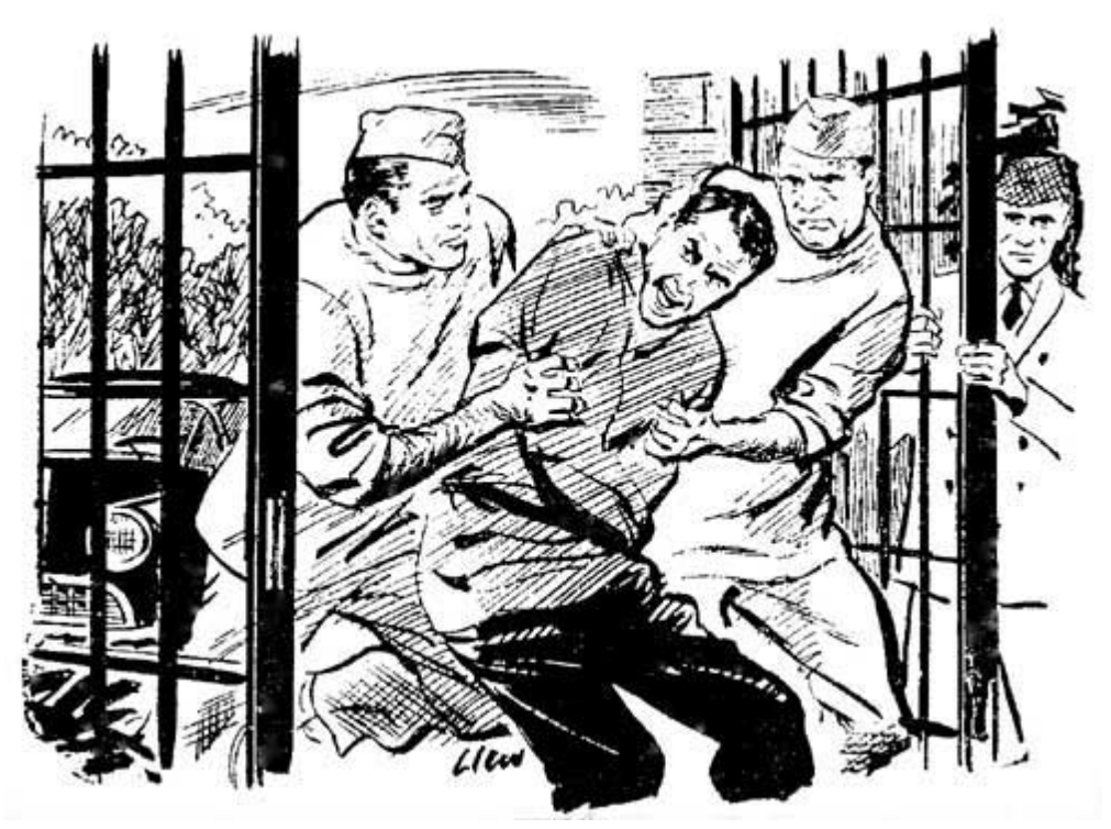
Had the sane restrained the insane, or was it the other way around?

"I think Doctor Pottgeiter's said the most reasonable thing I've heard since I came in here," he declared. "If my sanity is to be questioned, I insist that it be questioned by somebody qualified to do so."