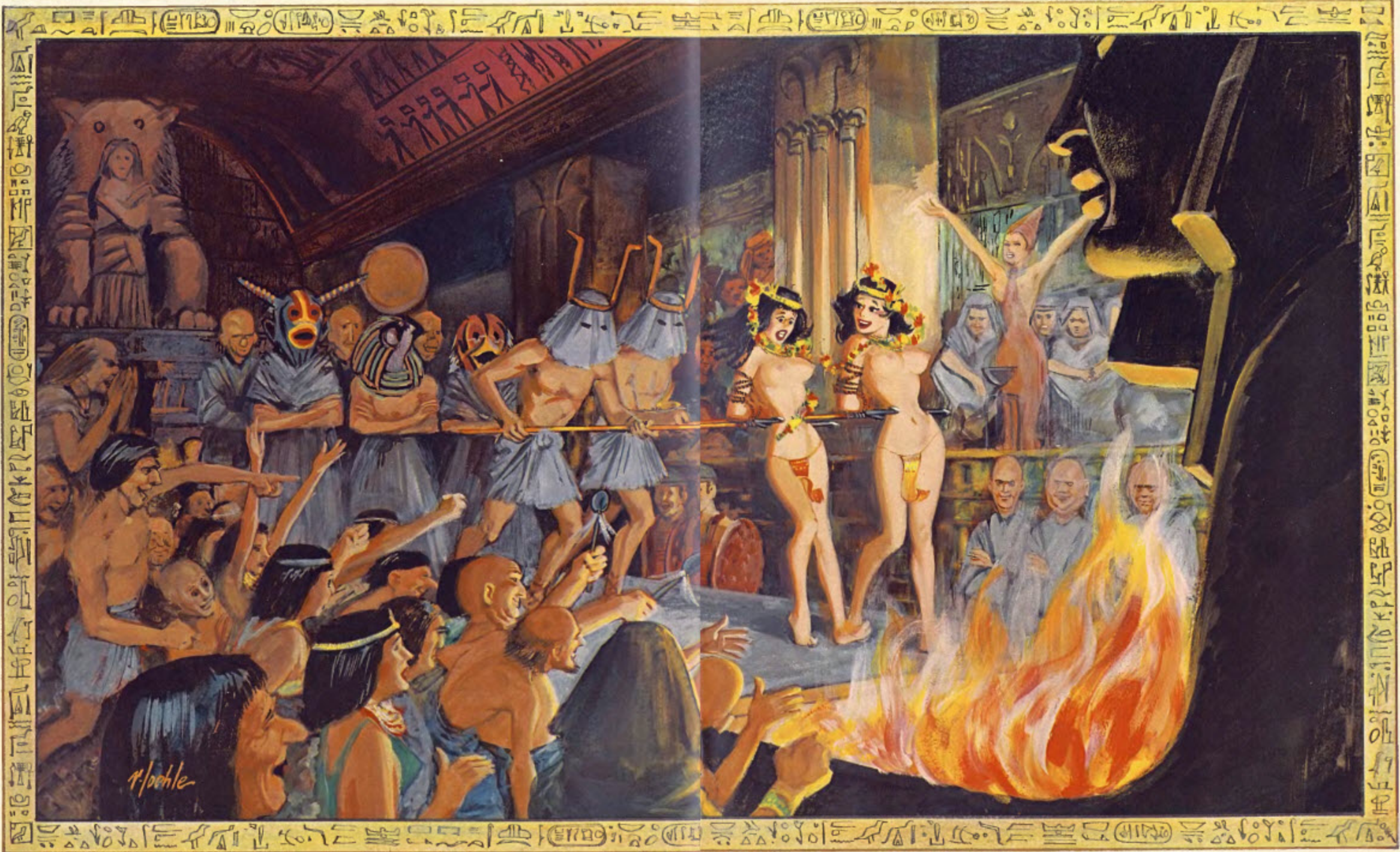
"The joke's on them—I'm no maiden."