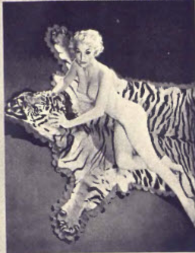
NEVA GILBERT: she posed on a tiger