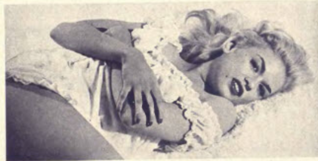
JAYNE MANSFIELD: now she's a star on broadway