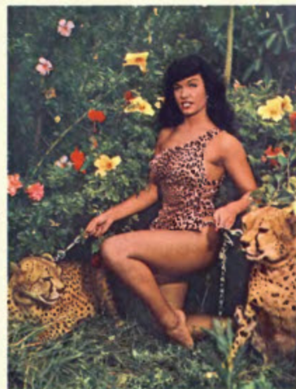
BETTIE PAGE: she made a very sexy santa