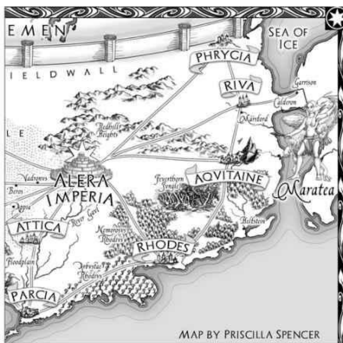
MAP BY PRISCILLA SPENCER