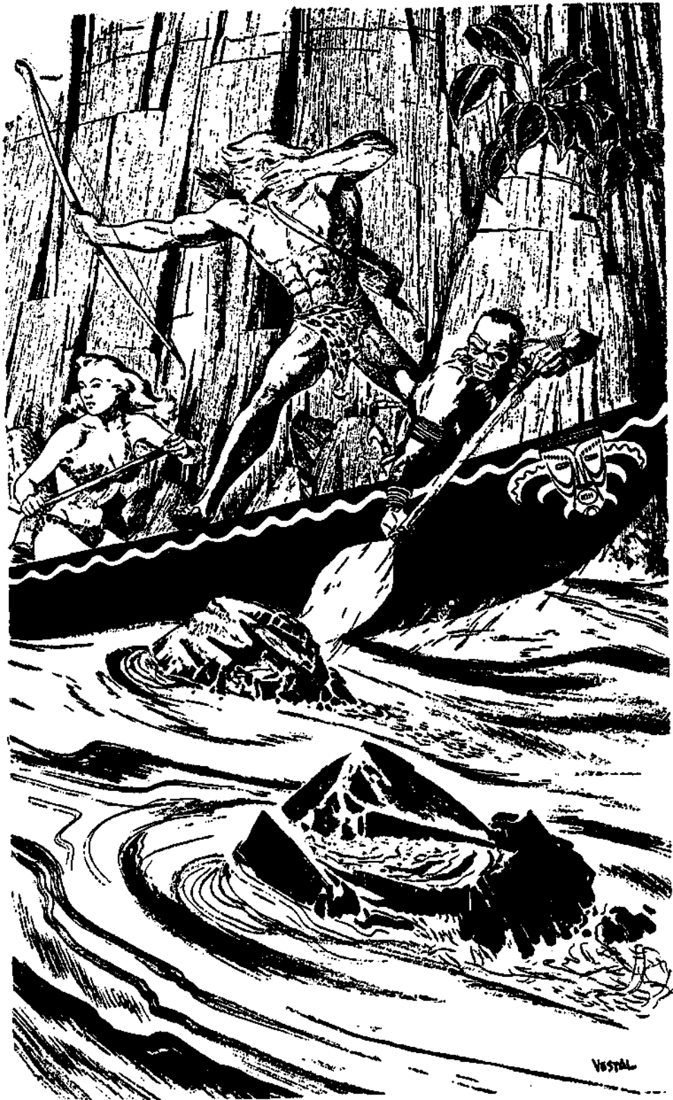
The river leaped and roared with whitecapped fury . . . Ki-Gor drove an arrow at the skull-prowed boat . . .