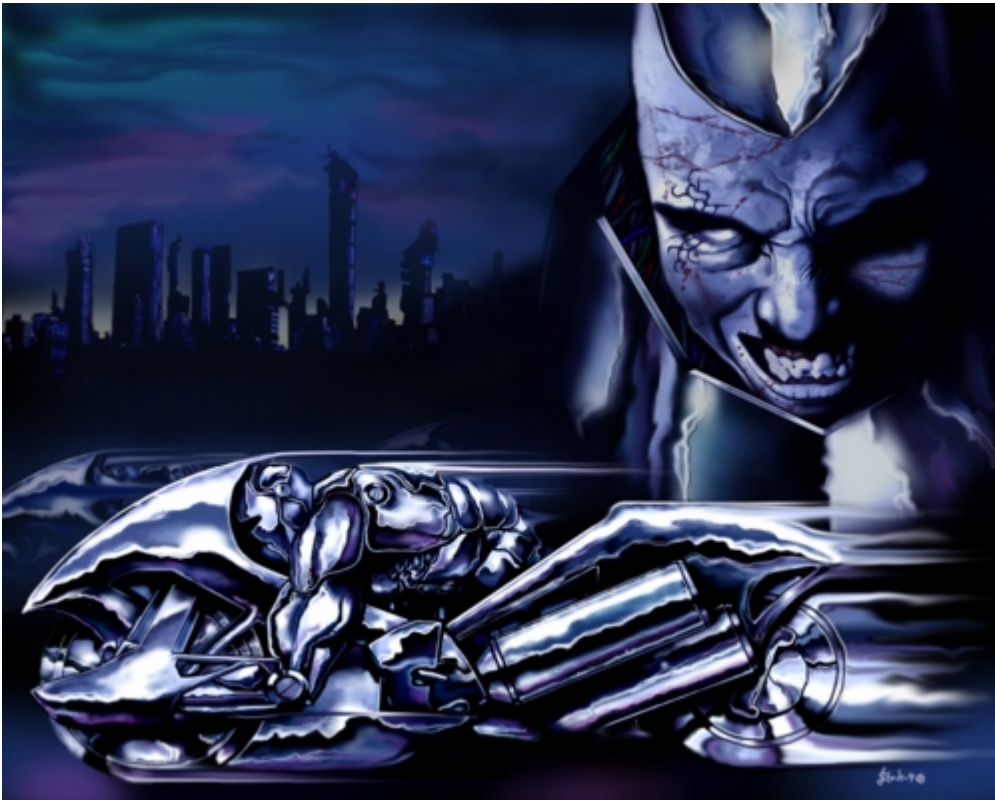
Illustration © 2003 Linus Persson

Eyes glued to his speedometer, Rush slammed both feet down against their pedals. His machine squealed with an archaic blast of adrenaline and screamed up the onramp. Coming up against the highway, he checked his right-of-way. For the moment, it was clear. Rush slammed into a blur -- and then he was gone.