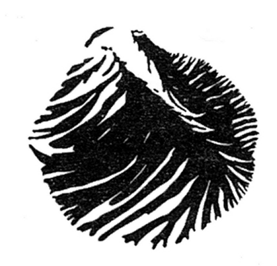
Art or not?

So much for science, and how helpful it can be in these times of environmental calamities. Chernobyl is still hotter than a Hiroshima baby carriage. Our underarm deodorants have eaten