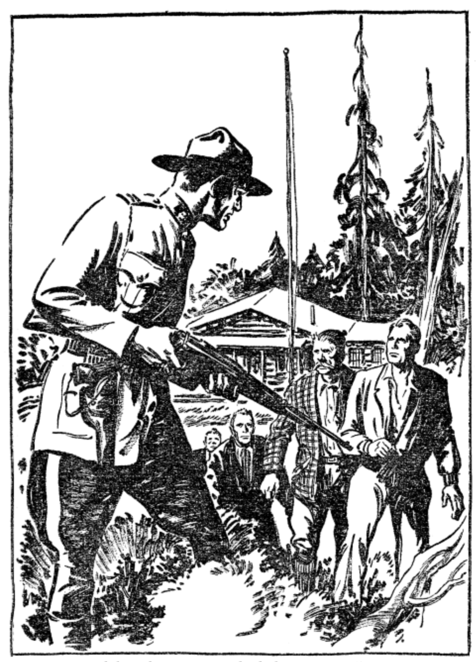
Doc and the others approached the station. "Want to see someone?" asked a voice. There was a man . . . with a rifle.