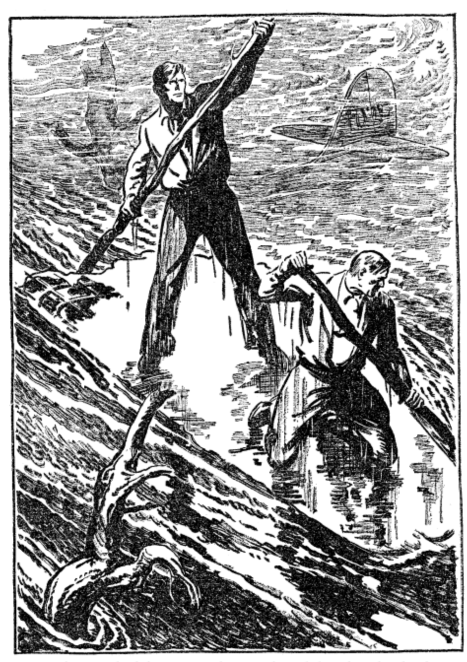
They worked the wing raft around until they found a dead tree. They poled along for some time in disgusted silence.

They poled along for some time in disgusted silence.