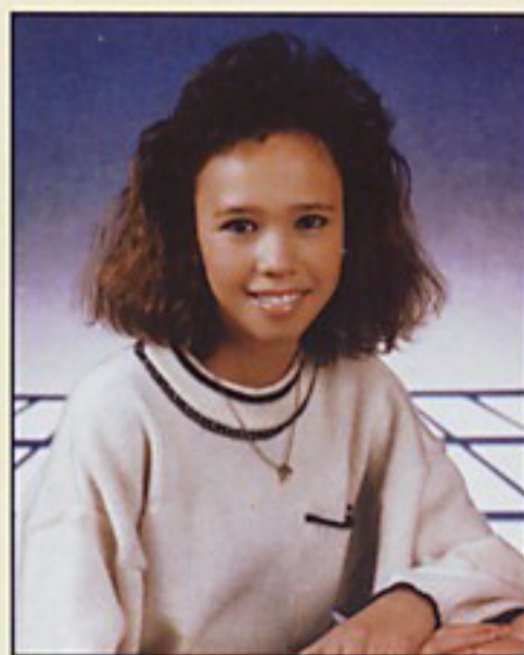
Quiet shy type.