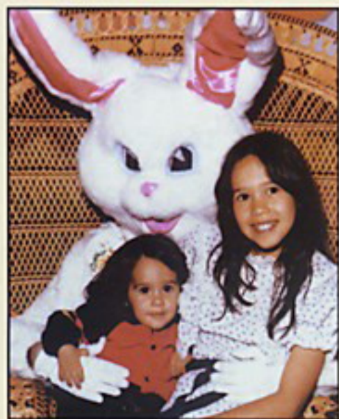
Even then I Loved bunnies.