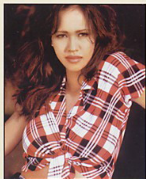
Not Any more!!!