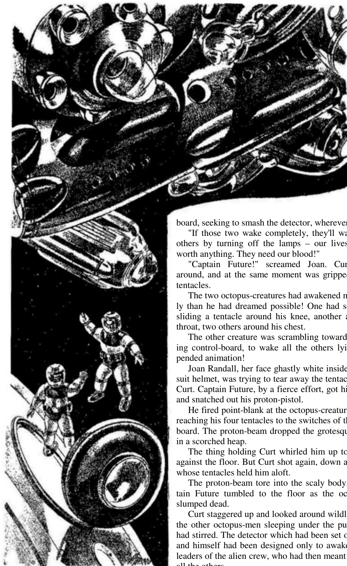
Dead ships floated around them (Chap. VI)

board, seeking to smash the detector, wherever it was.