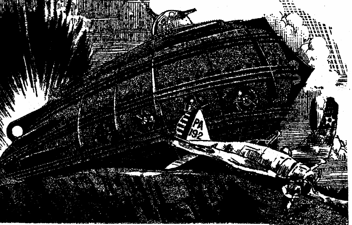
The squadron dove viciously down at the raider

Beside him on the desk, and on the floor around