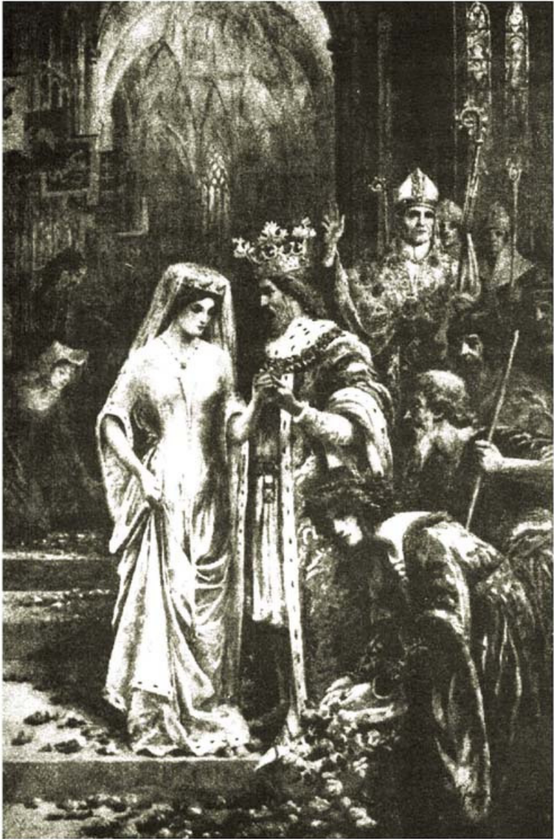
The Marriage of King Arthur