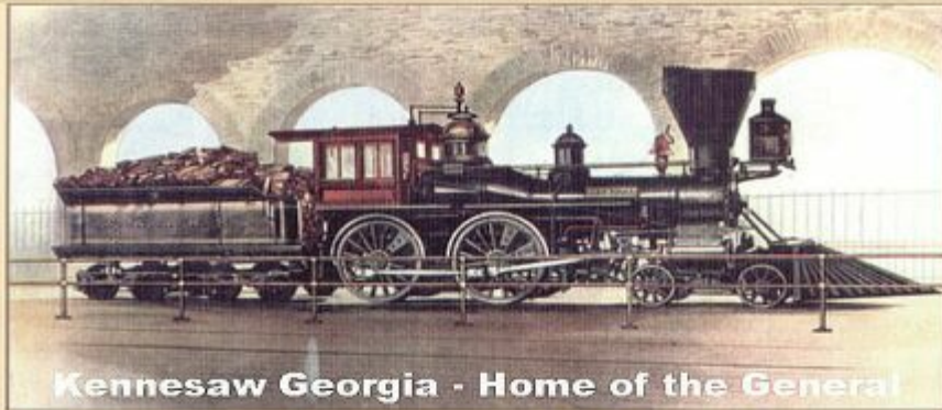
Kennesaw Georgia - Home of the General