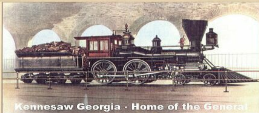
Kennesaw Georgia - Home of the General

wonders?" "You give us a hand, Ballin, in making people into citizens of the universe. So long as humans fear, that in itself is the monster. Once their fear has been conquered they will perceive the wonders of creation. It's a long road yet but at the end of it is humankind, to whom the universe belongs..." The End