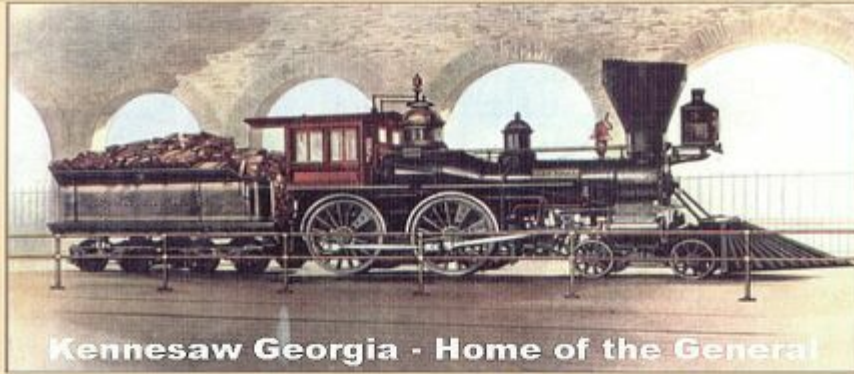
Kennesaw Georgia - Home of the General