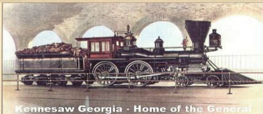
Kennesaw Georgia - Home of the General

As he came back toward me he was using it as a walking stick. Strange-what ideas these little barbarians of Terra came up with! The End