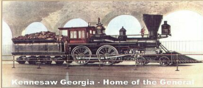
Kennesaw Georgia - Home of the General