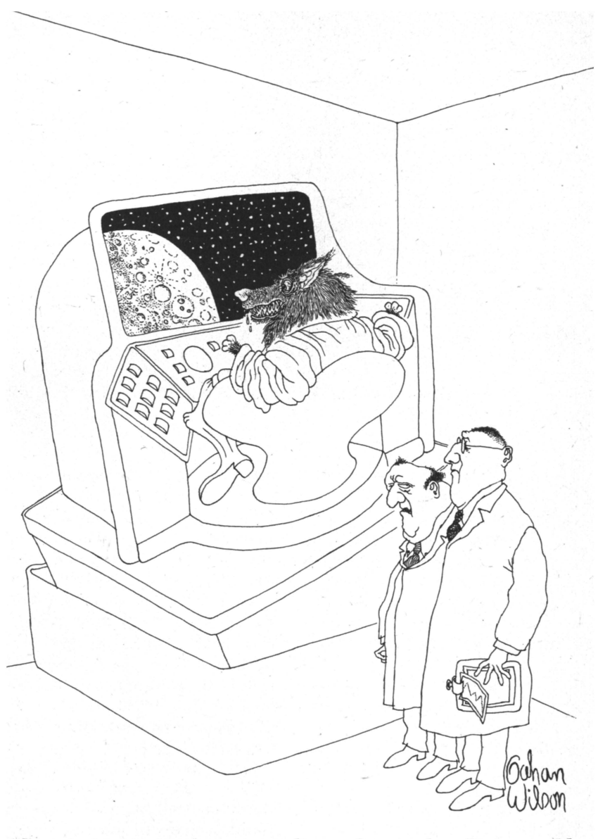
"I'm afraid this simulator test indicates Commodore Brent would be a poor choice for the Lunar Expedition."