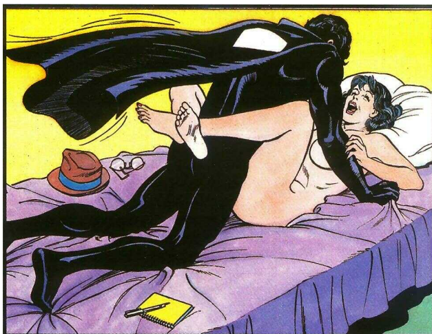
...THERE'S NO WAY THIS COULD BE SUPERMAN, NOPE, BECAUSE SUPERMAN IS © & © 1994 DC COMICS.