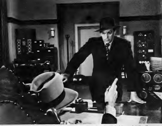
Dr. Vulcan's Henchman, Dirken, receives Sinister Instructions from the Criminal Mastermind Himself (concepted behind desk).

wext to Earth itself splitting asunder, whate could be more dramatic, teritying, awe-inspiring, for eq dille & overwhelming than the destruction of the United States' most monumental city? And not instartaneously by the disintegration, pulverization, volatization of thermo-nuclear bombardamin to the constraint of the constraint of the constraint of the constraint by the slower, shaking, grinding, diszying process of—earthquaked.