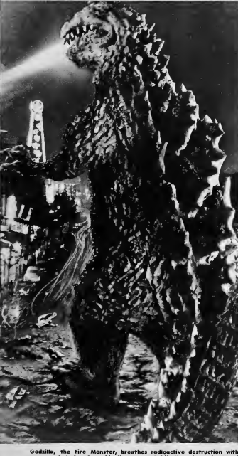
Godzilla, the Fire Monster, breathes radioactive destruction with every exhalation fram his fiery maw. While Kong (opposite page) knocks down holf of Tokyo, Godzilla sets the remainder of it aflame

King Kong is back & don't ask bow because nobody knows. The same way Dracula, done to death by wooden atake or silver builter or the dawn's and the same way to the same way more ghast appearance. The same way Frankenstein monster survives fatal falls & futile boilings. The same way the bound of the same way to be same way to the same way to be same way to the same way to be same way to be same way to be same way to be same way and the same way to be same way to be same So, batdes & gentlemen, in this cor-