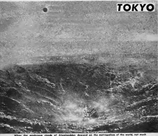
When the mushroom clouds of Atomigeddon descend on the motropolises of the world, not much recommendate to the form one not beest. Rodioscrive robble will be the herfuge of the horocritical survivers you yet HELAST WAR.