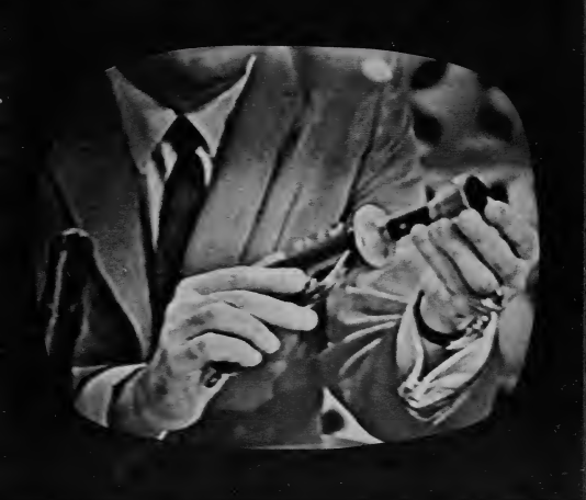
Out of the Ark! From the Archives of the Ackermansion, one of the original outhentic Buck Rogers zapguns, one of the few still-working models in the world today.

you think the food that we eat will be any different?" FJA: "Well, it's—if we're going to